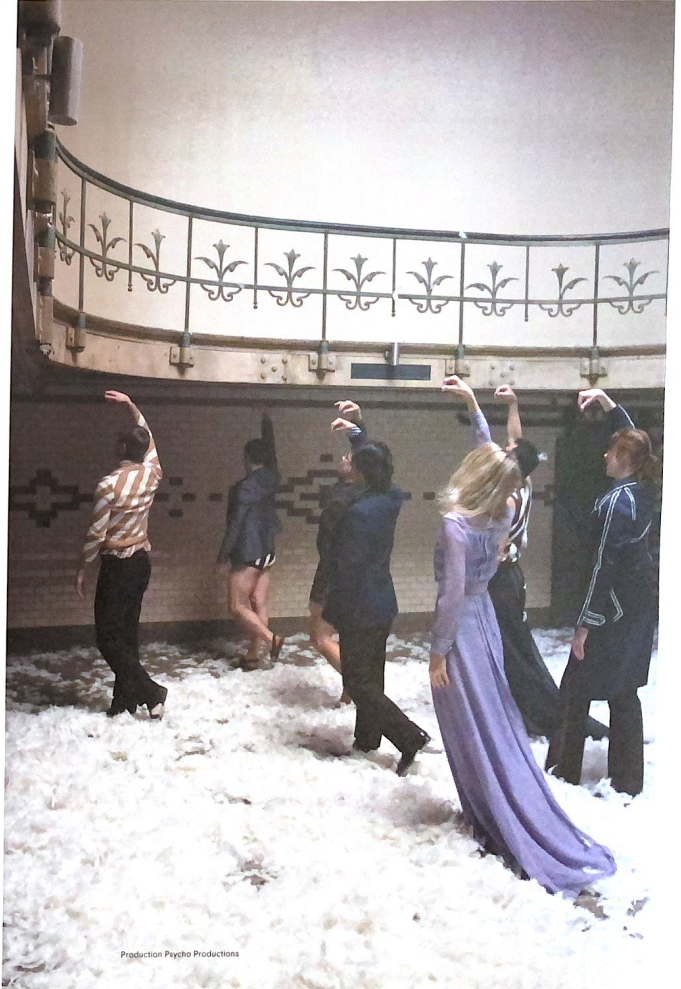
Production Psycho Productions